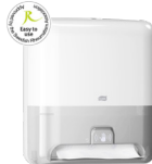
551100 Tork Matic® Hand Towel Dispenser with Intuition Sensor