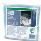
183600 183601, 183602, 183603 Tork Microfibre Cloths, Reusable