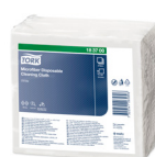
183700 Tork Microfibre Cloths, Disposable