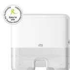
552100 Tork Xpress Multifold Mini