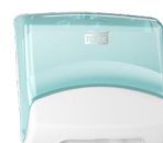
654000 Tork Performance Cloth Dispenser