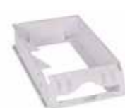
Tork Xpress™ Large Recessed Cabinet Towel Adapter