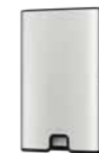
Tork Xpress® Multifold Hand Towel Dispenser