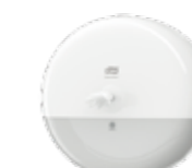
Tork SmartOne® Toilet Paper Dispenser