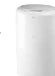
Tork Waste Bin 50 Ltr