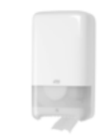
Tork Twin Mid-size Toilet Roll Dispenser