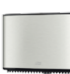
Tork Mini Jumbo Toilet Roll Dispenser