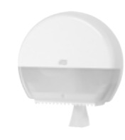
Tork Mini Jumbo Toilet Roll Dispenser