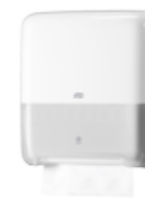
Tork Matic® Hand Towel Roll Dispenser