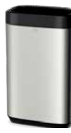
Tork Waste Bin 50 Ltr