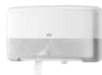
Tork Twin Mini Jumbo Toilet Roll Dispenser