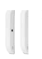
Tork EasyCube™ Visitor Registration Units