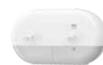
Tork SmartOne® Mini Twin Toilet Paper Dispenser