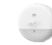
Tork SmartOne® Mini Toilet Paper Dispenser