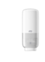
Tork Foam Soap Dispenser with Intuition™ sensor