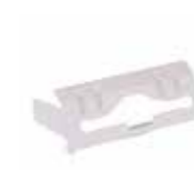
Tork Xpress™ Small Recessed Cabinet Towel Adapter