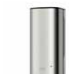
Tork Foam Soap Dispenser with Intuition™ sensor