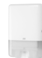
Tork Xpress® Multifold Hand Towel Dispenser