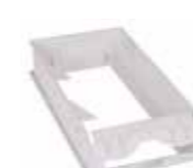
Tork Xpress™ Medium Recessed Cabinet Towel Adapter