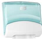
654021 Tork Folded Wiper/Cloth Dispenser