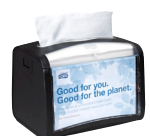
6232000 Tork Xpressnap Tabletop Napkin Dispenser