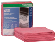
7002000 7003000, 7004000, 7005000, *assorted colors Tork Microfiber Cloths, Reusable