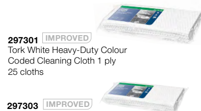
297301 IMPROVED Tork White Heavy-Duty Colour Coded Cleaning Cloth 1 ply 25 cloths