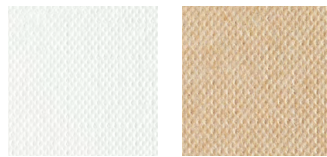
2310917 Tork Xpressnap White Napkin