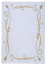
2308185 Tork Botanical Traymat