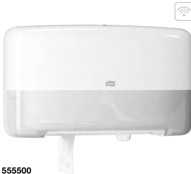
555500 Tork Twin Mini Jumbo Toilet Roll Dispenser

FSC certified, EU Ecolabel, 100% Recycled