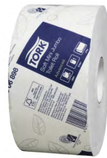
2306898 Tork Mini Jumbo 2ply Advanced 200m