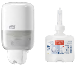
561000 Tork Mini Liquid Soap Dispenser

Made in New Zealand with more than 70% renewable energy