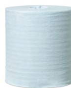
190491 Tork Low Lint Cleaning Cloth Handy Bucket Refill Rolls† 200 wipes