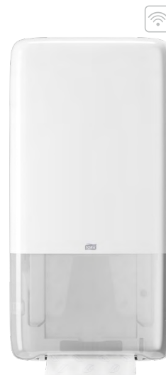
552500 Tork PeakServe Continuous Hand Towel Dispenser