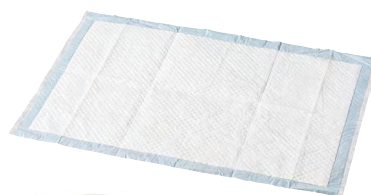
2170057 Tork Absorbent Sheet