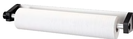
129184 Tork Couch Roll Dispenser C1