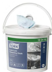
190492 Tork Low Lint Cleaning Cloth Handy Bucket† 200 wipes