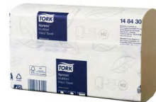
148430 Tork Xpress Slimline Multifold Hand Towel 1ply Advanced 185 sheets