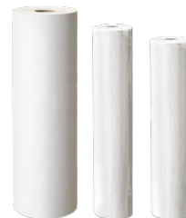
124164 Tork Couch Roll 184m x 58cm C1