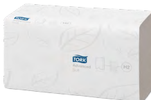
120289 Tork Xpress Soft Multifold Hand Towel 2ply Advanced 180 sheets