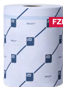
473263 Tork Reflex Wiping Paper Plus† Blue 2 ply 429 sheets