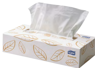
2311408 Tork Extra Soft Facial Tissue 2ply 100 sheets