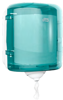
473180 Tork Reflex Single Sheet Dispenser