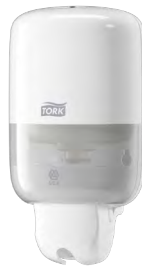
561000 Tork Mini Skincare Dispenser White