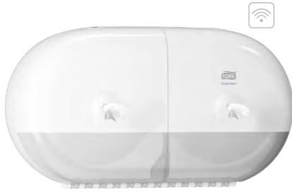
682000 Tork SmartOne Twin Mini Toilet Roll Dispenser