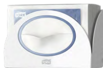
655100 Tork Small Pack Wiper Dispenser W8