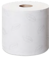
472193 Tork SmartOne Advanced† 2ply 650 sheets