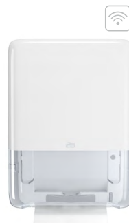
552550 Tork PeakServe Mini Continuous Hand Towel Dispenser