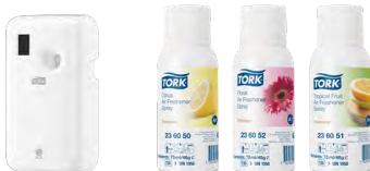
562000 Tork Air Freshener Spray Dispenser