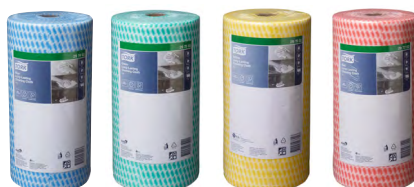
297402 | 297502 | 297602 | 297702 Tork Heavy-Duty Colour Coded Cleaning Cloth Roll 1 ply 90 cloths