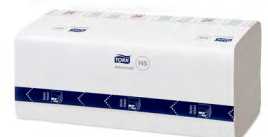
100589 Tork PeakServe Continuous Hand Towel 1ply Advanced 270 sheets