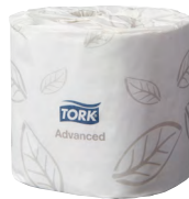
0000234 Tork Soft Conventional Toilet Roll† Individually Wrapped 2ply Advanced 400 sheets