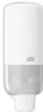
561500 Tork Skincare S4 Dispenser