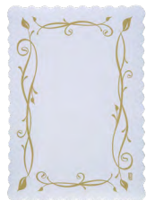
2308166 Tork Botanical Placemat