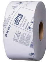
2306897 Tork Mini Jumbo 1ply Universal 400m