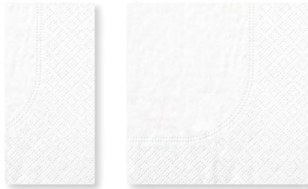
477554 Tork Edge Emboss White Dinner Napkin 2 ply 8 Fold