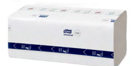
100585 Tork PeakServe Continuous Hand Towel 1ply Universal 410 sheets