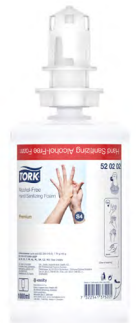
520202 Tork Hand Sanitising Alcohol-Free Foam 1,000mL