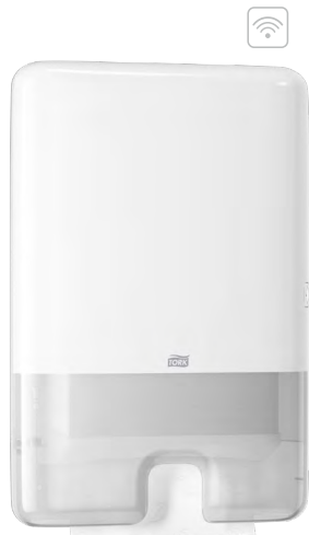
552000 Tork Xpress Multifold Hand Towel Dispenser