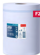
473480 Tork Reflex Wiping Paper† Blue 1 ply 805 sheets