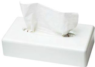
270023 Tork Facial Tissue Dispenser F1