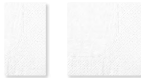
477402 Tork Edge Emboss White Lunch Napkin 2 ply 8 Fold