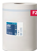
473242 Tork Reflex Wiping Paper† White 1 ply 857 sheets