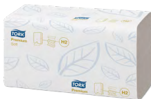
100289 Tork Xpress Soft Multifold Hand Towel 2ply Premium 150 sheets