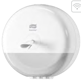
681000 Tork SmartOne Mini Toilet Dispenser