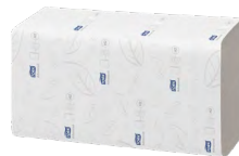
129089 Tork Xpress Flushable Multifold Hand Towel 2ply Advanced 200 sheets