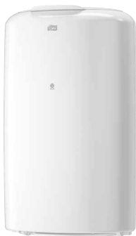
563000 &amp; 205630