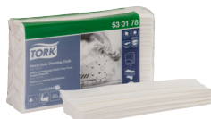
530178 Tork Heavy-Duty Cleaning Cloth

How else can we help? Get in touch to talk about your business.