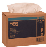
303362 Tork Paper Wiper Pop-Up Box

Tork solutions support the strictest hygiene protocols to help prevent infections and improve safety.