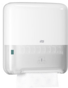
551000 Tork Matic Hand Towel Roll Dispenser