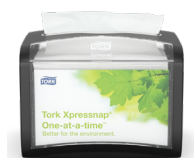
272611 Tork Xpressnap® Tabletop Napkin Dispenser

Tork solutions ensure the very best practices for cleanliness and comfort in these busy gathering spots.