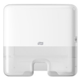
552100 Tork Xpress® Mini Multifold Hand Towel Dispenser

Tork user-friendly systems make it easy to prevent cross-contamination while improving image and the experience.