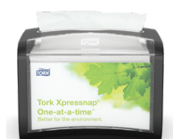
272611 Tork Xpressnap® Tabletop Napkin Dispenser

Tork solutions ensure the very best practices for cleanliness and comfort in these busy gathering spots.