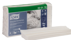
530178 Tork Heavy-Duty Cleaning Cloth

How else can we help? Get in touch to talk about your business.