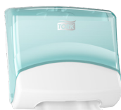
654000 Tork Folded Wiper/Cloth Dispenser

Tork solutions support the strictest hygiene protocols to help prevent infections and improve safety.